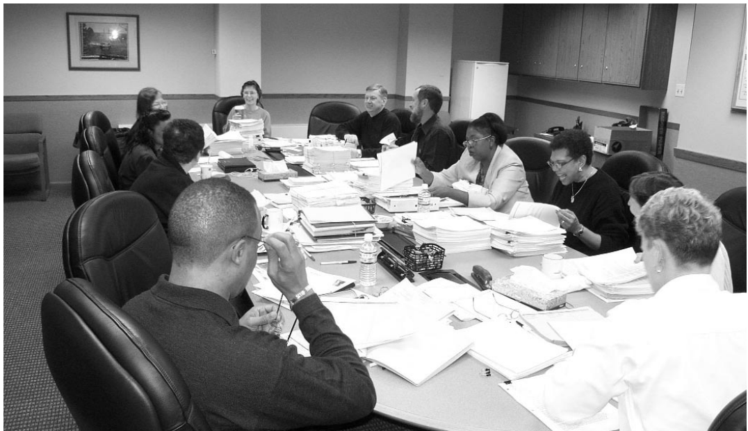
October 2002 Meeting.

The JRCERT welcomes both Directors and looks forward to their service on the Board.